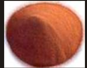
Nano Crystalline Amorphous Powders3